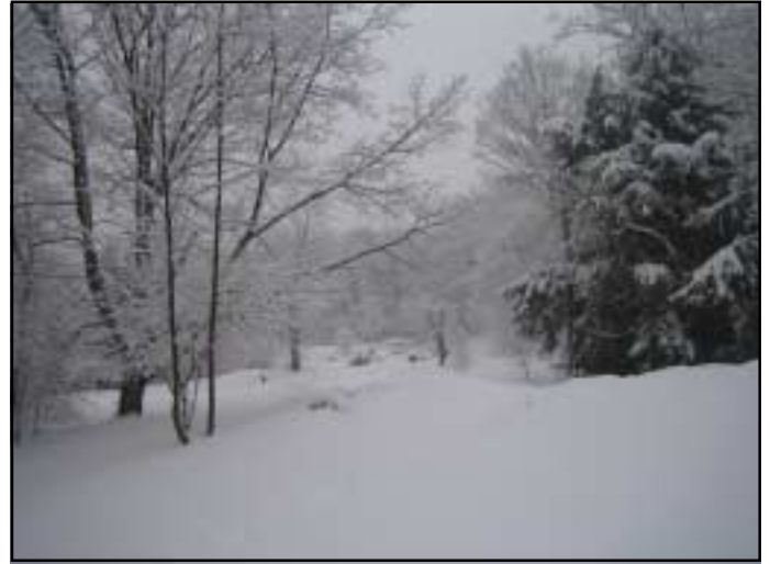
One month ago!

Development Instructors from last year's February team returned from Mozambique, Zambia and Angola and