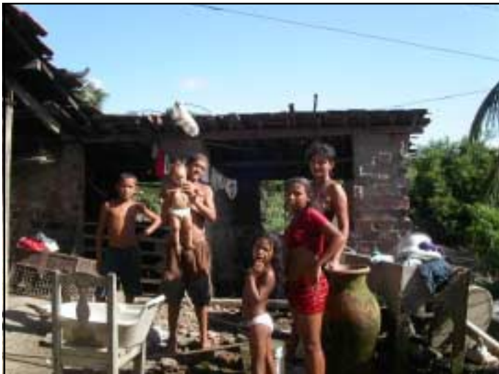
"Some of the families are much poorer than I expected"

At first, I had problems communicating with the families. Still, I cannot speak Portuguese fluently, but much has improved since then.