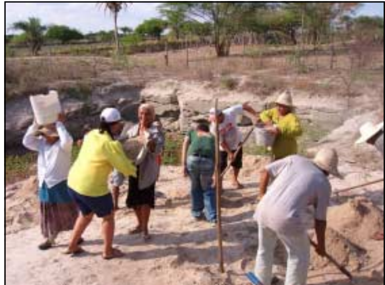
Once a month we have a common action in the community. Here we have a cleaning action.